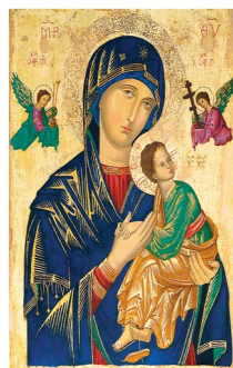
Our Mother of Perpetual Help, pray for us!

O Mother of Perpetual Help, grant that I may ever invoke thy most powerful name,- which is the safeguard of the living and the salvation of the dying. O Purest Mary, O Sweetest "Mary; let thy name-henceforth be -ever on my-Lips; Delay not, O Blessed Lady to help me whenever I call on Thee, for, in-all my needs; in all my-temptations shall never cease to call on Thee, ever repeating Thy sacred name, Mary, Mary. O