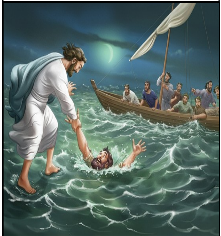
Story found in Matthew 14:22-33

Sunday, August 13, 2017 19th Sunday in Ordinary Time