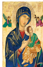
Our Mother of Perpetual Help, pray for us

O Mother of Perpetual Help,- grant that I may ever invoke thy most powerful name,- which is the safeguard of the living and the salvation of the dying. O Purest Mary, O Sweetest "Mary; let thy name-henceforth be -ever on my-Lips; Delay not, O Blessed Lady to help me whenever I call on Thee, for, in-all my needs; in all my-temptations shall never cease to call on Thee, ever repeating Thy sacred name, Mary, Mary. O what consolation, what sweetness, what confidence, what emotion fill my soul when I pronounce Thy sacred name, or even only think of Thee. I thank God for having given Thee, for my good, so sweet, so powerful, so lovely a name. But I will not be content with merely pronouncing They name: let my love for Thee prompt me ever to Hail Thee, Mother of Perpetual Help.