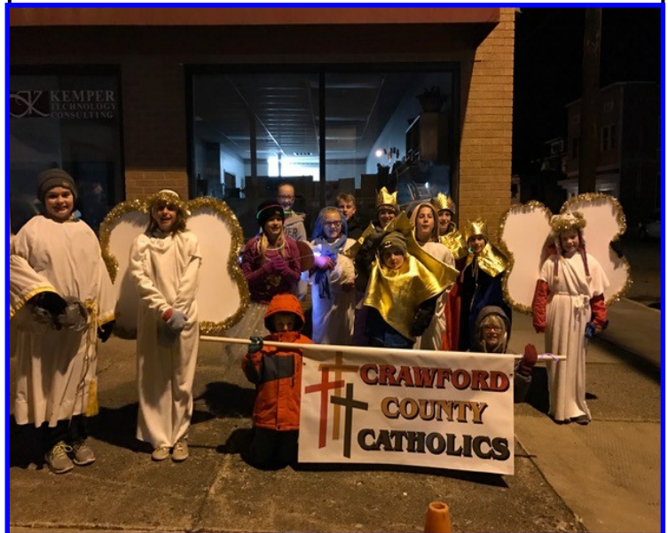
These students participated in the Christmas Parade Sat. Nov. 19, 2016.