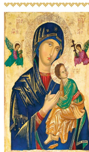
Our Mother of Perpetual Help, pray for us!

O Mother of Perpetual Help,- grant that I may ever invoke thy most powerful name,- which is the safeguard of the living and the salvation of the dying. O Purest Mary, O Sweetest "Mary; let thy name-henceforth be -ever on my- Lips; Delay not, O Blessed Lady to help me whenever I call on Thee, for, in-all my needs; in all my-temptations shall never cease to call on Thee, ever repeating Thy sacred name, Mary, Mary. O what consolation, what sweetness, what confidence, what emotion fill my soul when I pronounce Thy sacred name, or even only think of Thee. I thank God for having given Thee, for my good, so sweet, so powerful, so lovely a name. But I will not be content with merely pronouncing Thy name: let my love for Thee prompt me ever to Hail Thee, Mother of Perpetual Help. Recite Nine hail Mary's.